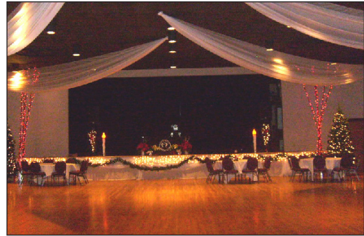
We were back at the 301 on Main Event Center for our Holiday Dance last December.