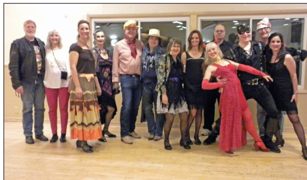
We had a parade of costumes. Here's the entire group!