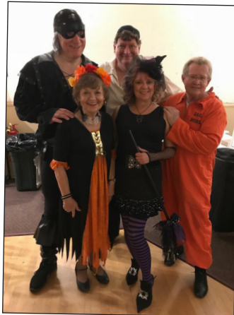
Costume contest judges.